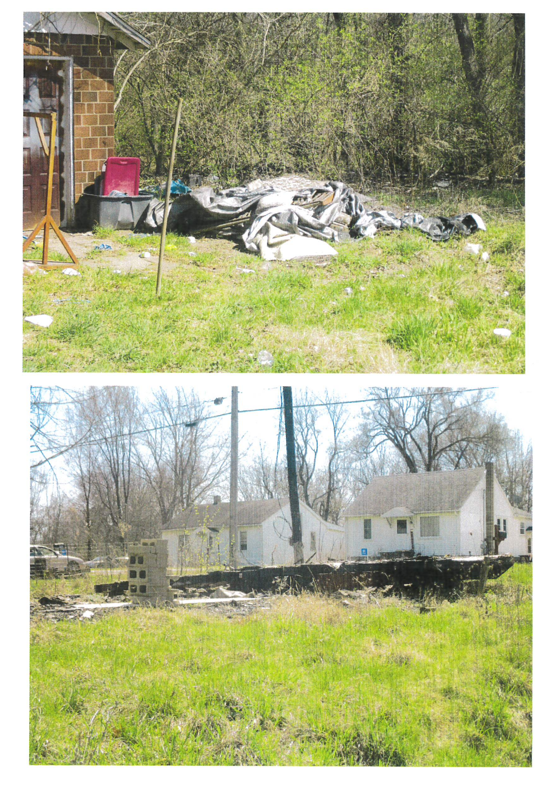
Date: 4/11/2023 Time: 11:31 AM Direction: Northeast Exposure #: 9 Comments: A pile of couch cushions, a tarp, and some carpeting.