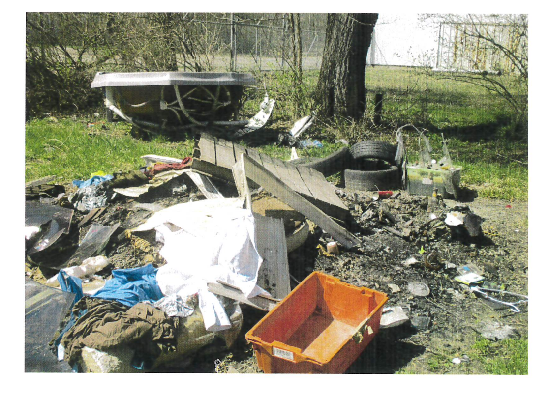
Date: 4/11/2023 Time: 11:30 AM Direction: Southwest Photo by: L. Grumieaux Exposure #: 4 Comments: Totes, siding, cushion, some rusted metal.

Date: 4/11/2023 Time: 11:30 AM Direction: West Photo by: L. Grumieaux Exposure #: 3 Comments: first burn pile contains- TV, construction material, broken glass, pallets, tires, clothing, and household waste.