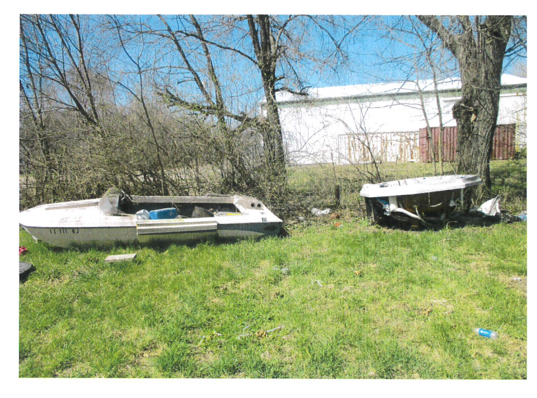
Date: 4/11/2023 Time: 11:30 AM Direction: West Photo by: L. Grumieaux Exposure #:2 Comments: Hot tub and boat are not tarped and are on the ground.

Date: 4/11/2023 Time: 11:30 AM Direction: West Photo by: L. Grumieaux Exposure #: 1 Comments: First burn pile.