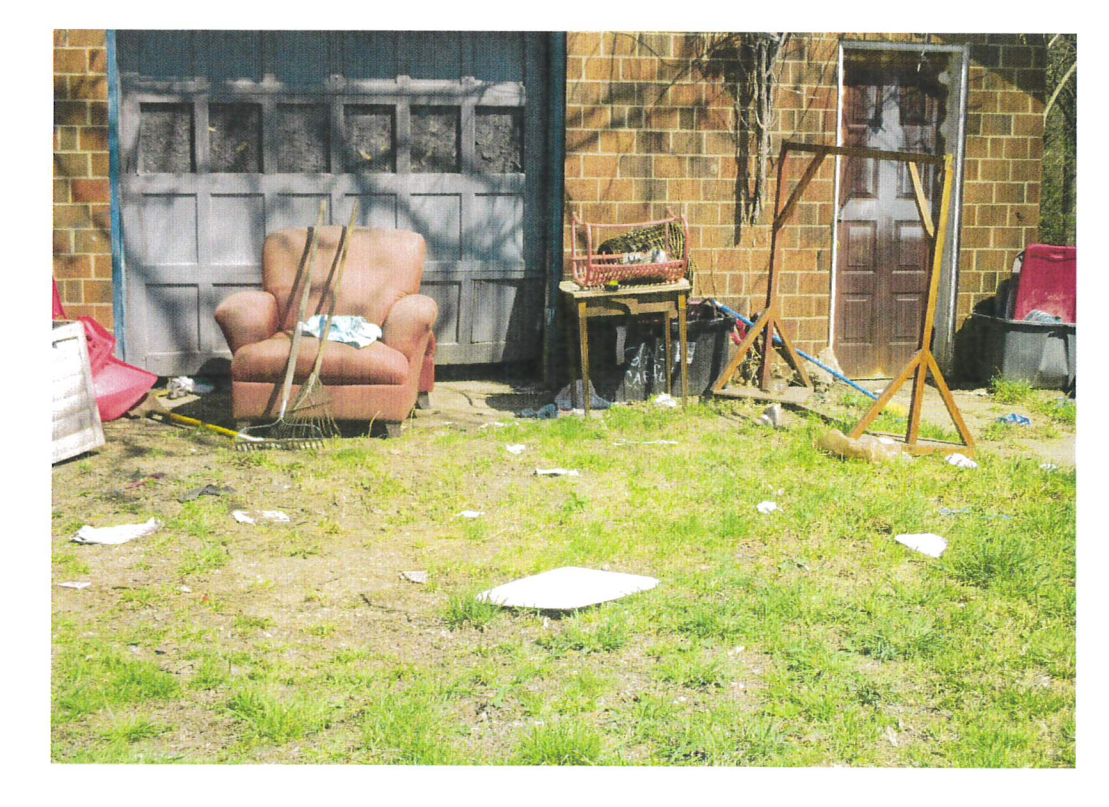
Date: 4/11/2023 Time: 11:31 AM Direction: North Photo by: L. Grumieaux Exposure #: 8 Comments: Household furniture. yard tools, and other misc. items stored in front of the garage.

Date: 4/11/2023 Time: 11:31 AM Direction: North Photo by: L. Grumieaux Exposure #: 7 Comments: More construction debris, yard storage equipment, more totes, tarps, and aerosol can.